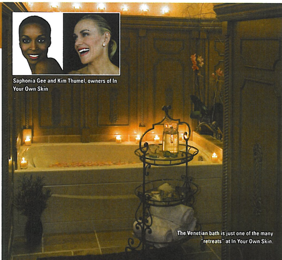
The Venetian bath is just one of the many "retreats" at In Your Own Skin.